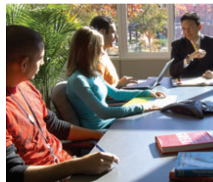
The Venture Development Center offers students an applied learning laboratory where they can find intensive mentoring and other support as they work to create new businesses.